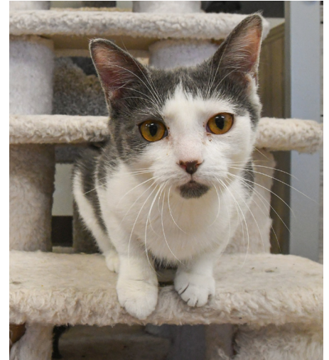
The best is yet to come for beautiful Bonifacia now

Soon, Bonifacia was tumbling into happy mischief and playing “lacrosse” with other cats. Her hazel eyes