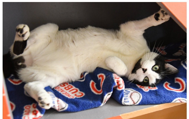
The Linda Fund saved darling Drummer

When bad news crashed like cymbals, Drummer returned to Tabby's Place. His urinary blockage would require intensive care