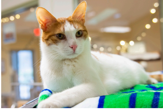
The Linda Fund is ... Kozmo, who would not have survived without surgery

It's intensive care for a newborn kitten, abandoned by his mother but found by fierce love.