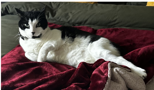
Healthy Drummer thrives in his forever home

Your gift today will play love's music for the next little Drummer boy in need.