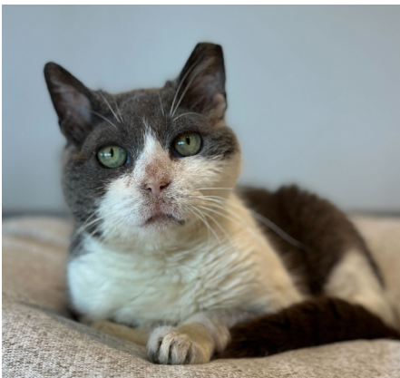
Mars has traveled light years from her days of pain

"Suffering" is a planet no cat should visit. But when life hurls cats like comets, Tabby's Place is there to catch them.