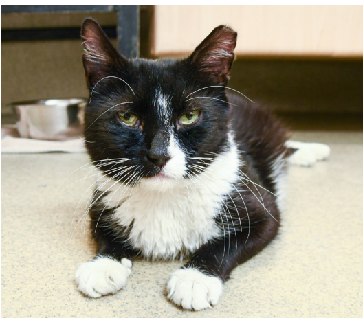
Life is both sweet and savory for dear Taylor Ham today

Even in his pain, Taylor Ham tried his best to take care of others. Whether feline or human, everyone