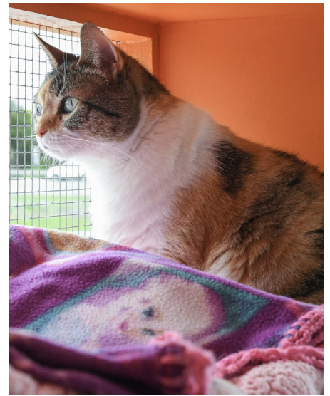
The Linda Fund is ... Cassie, who once lived in excruciating pain

As our reserve for critical care, the Linda Fund makes all the difference. This vital fund is the only reason we can leap into action for cats in their