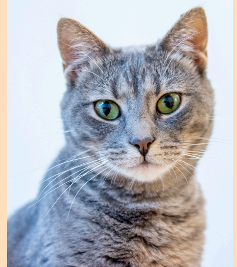
Prescott hopes you will help save cats like her

Please give your love today. Now is our time!