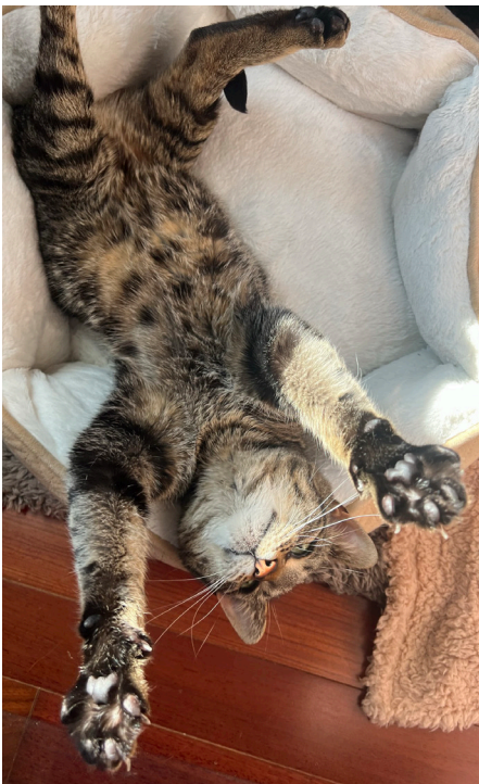
Dani's life is utter delight in her forever home

I had just lost Tabby's Place alum Astell , my beloved senior who inspired me to adopt another Special Needs cat. There, in the Community Room, was Dani: a girl who had