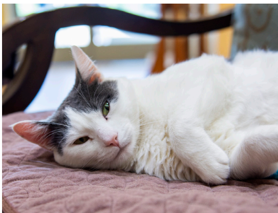
The Linda Fund broke chains of pain for little Charm

situation was desperate ... and no one believes in "hopeless" at Tabby's Place.