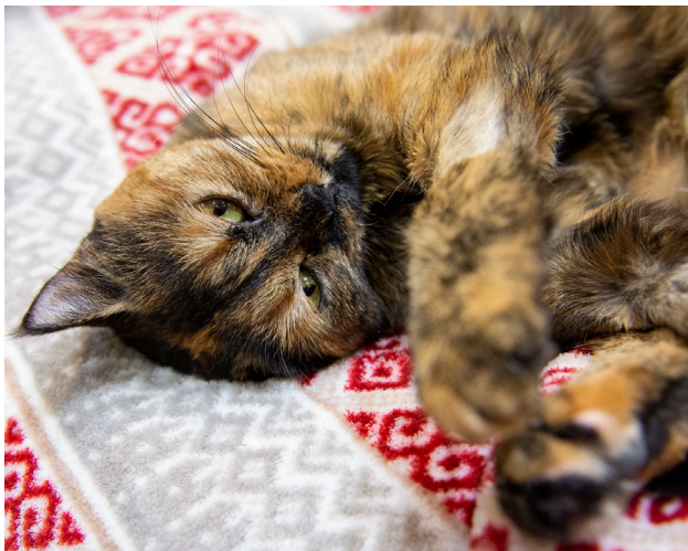
The Linda Fund saved Nina from a lifetime of fear and trembling

Love goes the distance ... and today, Nina is loved and thriving in a forever home of her own!