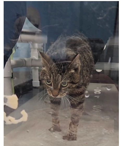
Dani is a rock star in physical therapy

Dani has also become a cat of adventure. She attends weekly appointments at the Whole Animal Gym, getting acupuncture for her spinal inflammation, physical therapy to improve her gait, as well as massages, laser, and water treadmill time! She now walks more than she "scoots." Although Dani would tell you hardwood is quite slippery, on carpet she can keep up with the rest