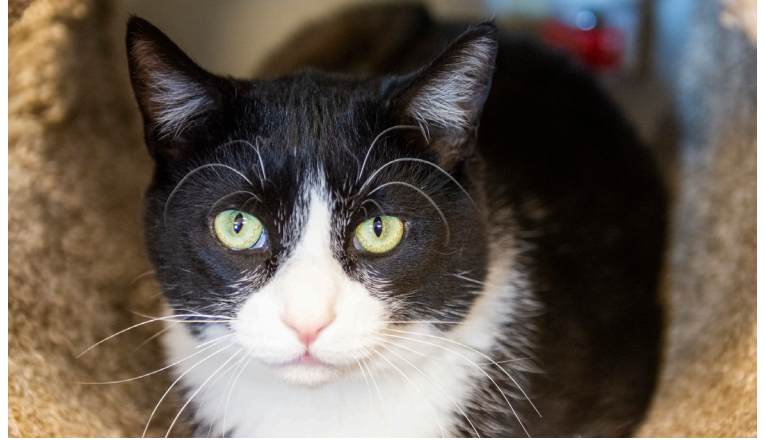
Your IRA can save the day for a cat like Gulliver, saved by emergency surgery via the 2022 Linda Fund

Click here to learn more about the process of delivering L-O-V-E through your RMD!