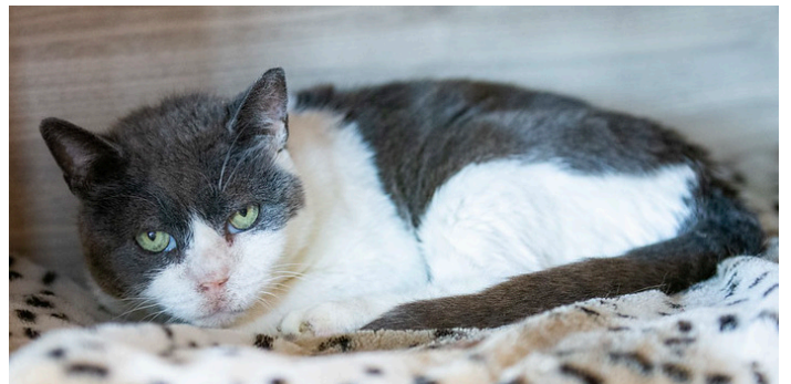
The stars have aligned for darling Mars at Tabby's Place

Love is the meaning of the Linda Fund , and love is your intergalactic superpower when it comes to cats like Mars. Please donate from the depths of your heart today.