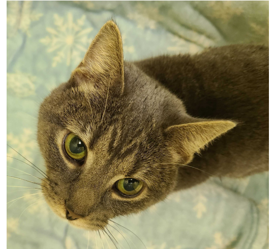
Precious to everyone at Tabby's Place, Prescott loves being loved

Today, Prescott's future is as bright as her starry eyes. Intensive care saved her life, and she's flourishing in a foster home with skilled caregivers. Tenderhearted Prescott is forgiveness on four