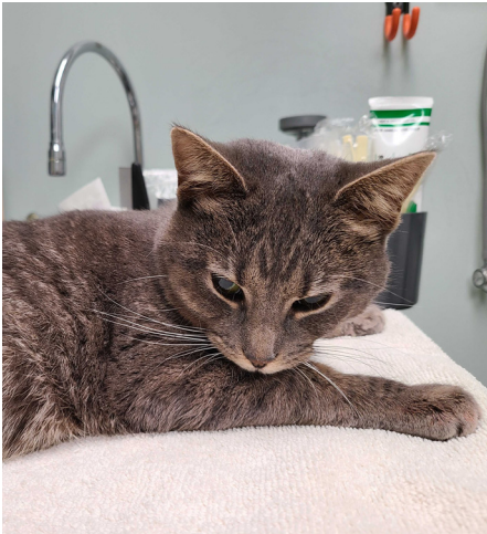
Prescott purred and loved us even as she arrived in agony

In a cold New England winter, Prescott walked alone. But one terrible day, someone or something hurt the soft little moonshadow... badly.