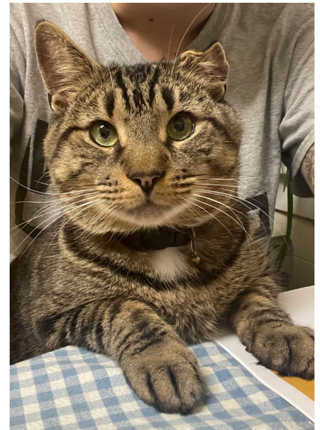
The one, the only, the magnificent Crinkle Bob!

It brings me so much joy to now be able to teach others about