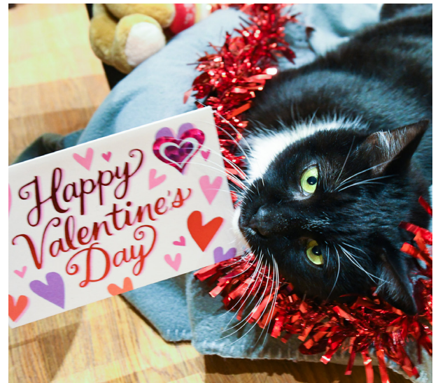
Your Donor-Advised Fund can save Special Needs cats like Antin

Navigator rating , Tabby's Place is a trustworthy steward of your generosity.