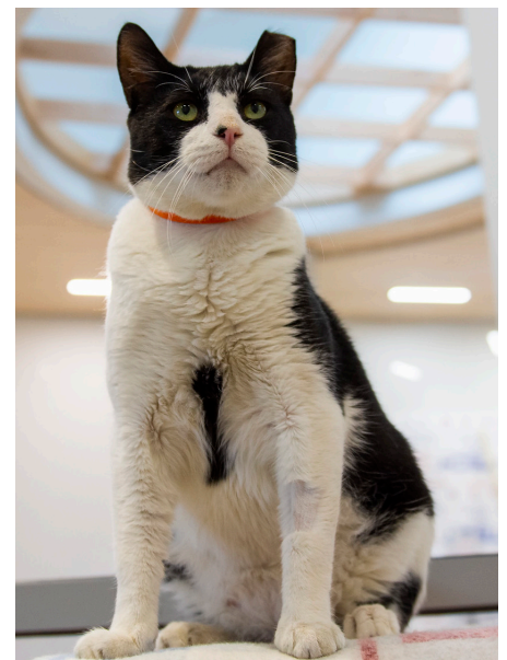
Tucker treasures his new life in Quinn's Corner at Tabby's Place

It could have been a very different Valentine's Day for Tucker. But thanks to people like you, he's got us all tucked in his heart's front pocket. With your help, we'll welcome many more FeLV+ Valentines in the months ahead. Please click here to give them your heart.