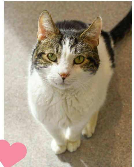
Durin would be devoted to you

You can't put a price on love, but your new feline family member hopes you'll put this savings towards