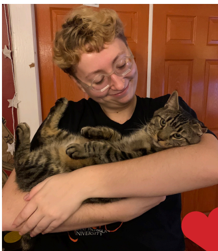
Crinkle Bob is cherished

Crinkle Bob’s fan club at Tabby’s Place may miss him forever, but our eyes will always crinkle with happy tears at his memory. We are all better and sweeter for having been “Crinkled!”