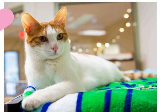
Kozmo traveled from Beirut for life-saving surgery...and unconditional love desperate. They knew us as the world's haven for cats no one else could handle. Could we possibly welcome some of their most fragile rescues?