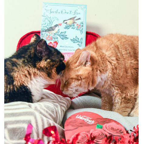
Sponsor our Elderly Care Fund, and you'll lavish love on Agnes , Toulouse , and all our golden oldies

you unconditionally...and they hope you feel the same. Click here to meet your meowing match today!