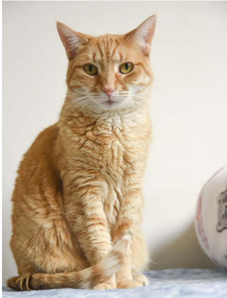
Cleopatra would love to be your queen

With prices rising on everything from fuel to Fancy Feast®, it's