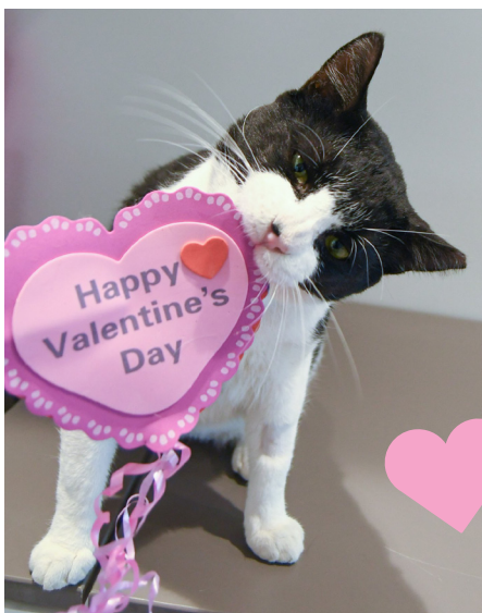
Every day is Valentine's Day for our valiant FeLV+ boy

Big hearts brought Tucker to Tabby's Place after he tested positive for feline leukemia virus