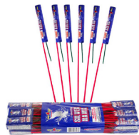
Silver Hawk Bottlerockets

If you were a child in the 50's or 60's, you may recall bottle rockets , a small firework on a long stick. You placed the stick in a bottle, lit the fuse and stood back. The rocket would take off, accompanied by a loud whistle and head skywards,