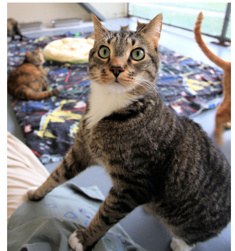
Our beloved bottle rocket was always on the hunt for fun

just jostled off to the next potential partygoer. This was all made more hilarious by his awkward gait. He walked as if he had a permanent “wedgie.”