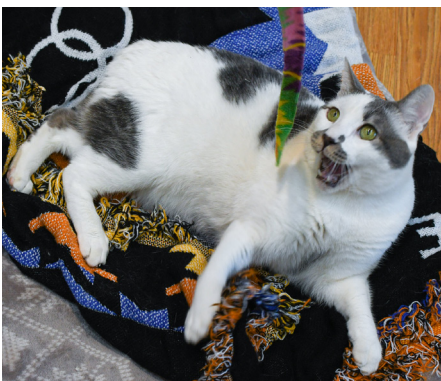
Hips is the happiest goofball on either side of the Atlantic

Reading about Beirut-born Tabby's Place residents like Hips and Kozmo , you may have asked these