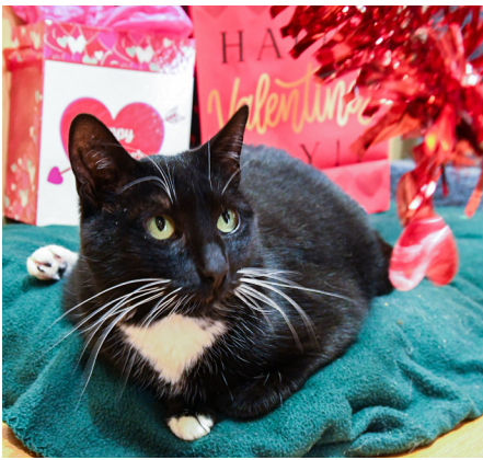
Will you be Olive's adoring sponsor?

gigantic heart to cats who yearn for you...and they'll send you love letters all year.