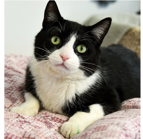
In 2022, your generosity saved Gulliver (and so many others)

might say, "thanks for positioning us to save more cats from hopeless situations than ever before."