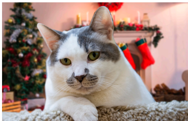
Hips hopes you'll help him shout 'hip, hip, hooray!' while honoring your loved one