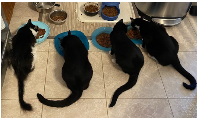
FeLV and all, life is a feast for the Dublin Dudes