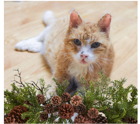
Glenn is grateful for your love in any form

Tabby’s Place’s tax ID is 22-3695520. Contact Angela at ah@tabbysplace.org or 908-237-5300 ext 235 to find out more. Thank you for making a powerful investment in our cats’ lives!