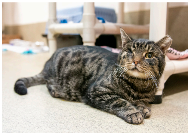
Viktor makes us all feel like champions of love!

We have a feeling Viktor's next victory will be a forever home. But, given his Special Needs, we know that will take a very special family. In the meantime, you can enter the winner's circle as his sponsor. Please click here and help our striped sweetie sing "Joy to the World" this winter.