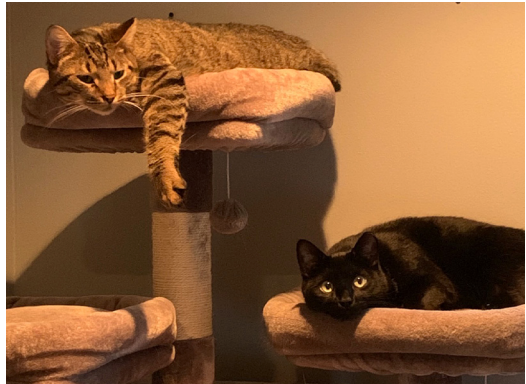
Max and Guen, two happy Tabby's Place alums