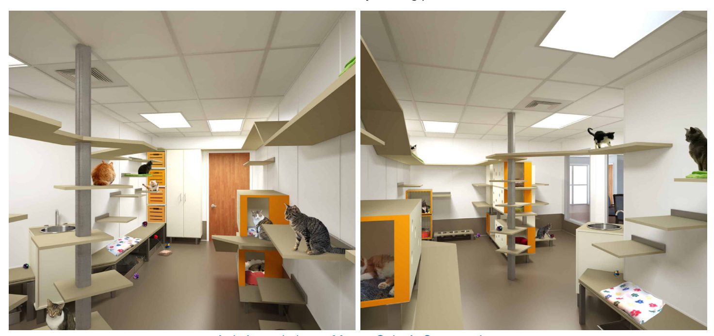
Artist's renderings of future Quinn's Corner suites

This all means we have entered the final stretch. Groundbreaking is in sight. And while there will be unavoidable hiccups, Quinn's Corner will be here before we know it.