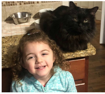
Quinn's Corner will nurture FeLV+ cats like recently-adopted Gravy, pictured here with his new best friend

Cats infected with feline leukemia virus (FeLV) are the most vulnerable kitties in the world. The disease is difficult to diagnose and