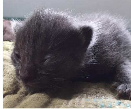
Neonatal kittens like Maeve will thrive in Quinn's Corner