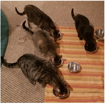
Feeding time for the FeLV+ kitties

We tried to minimize our sorrow by trading stories of all his endearing antics, and we took great solace in the