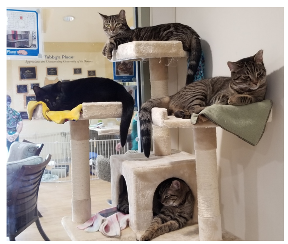
The FeLV+ kittens at Tabby's Place

Soon they were climbing on everything and chasing wand toys