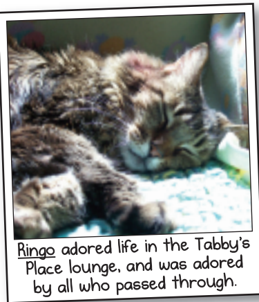
Ringo adored life in the Tabby's Place lounge, and was adored by all who passed through.

Much to our joy, a wonderful couple fell in love with Ringo early this year and he finally had his "forever home." Sadly, in April, Ringo's kidneys began to show signs of failure and his health declined rapidly. Within a few days, it became clear to his new family that it >>