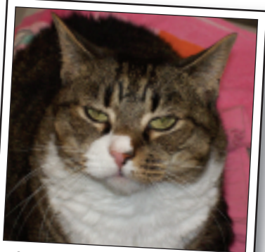
'Canned or wet food?' Maggie says, 'Both.'

Many people prefer feeding dry food because a full bowl can be left out all day without spoiling. While this is more convenient for owners, some cats may benefit from scheduled feedings. At the very least, owners should be sure they can measure the amount of food their cats eat so they can make appropriate adjustments. Working together with your veterinarian, you can find the food option that best suits your cat's unique needs.