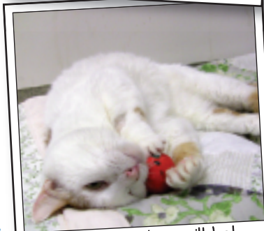
Playing together will help your new cat to trust you, as Larry demonstrates.