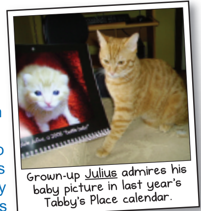
Grown-up Julius admires his baby picture in last year's Tabby's Place calendar.

Today, Julius sleeps with his “mommy” every night and follows her around during the day. Julius' owner wanted Julius to have friends while she was away, so she adopted Katje and Yoshi. Julius loves to play and wrestle with “his” kittens, but when nighttime comes he's back to snuggling in bed with his mommy. I have had the honor of babysitting Julius twice when his owner left town. It was wonderful to spend time with him again, and to see how his personality has developed. He is still the sweet, loving boy I remember. Julius just had his first birthday, and his owner told me she had a birthday party for him. She said Julius continues to be such a joy, and every time she thinks of him she breaks into a smile. It makes me smile and warms my heart to know my baby Julius is so loved.