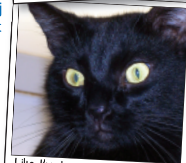
Like Kurt , your new kitty will just need time to learn to trust you.