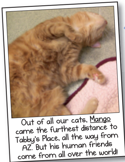
Out of all our cats, Mango came the furthest distance to Tabby's Place, all the way from AZ. But his human friends come from all over the world!

And, I must say that we are especially tickled to have donors in such exotic (to us) places as the United Arab Emirates and Bulgaria. Love of cats and caring hearts are, clearly, universal.