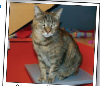
At age 20, Nickey is the epitome of all a cat can be, FIV+ or otherwise!