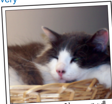
A safe space of her own will help any cat, like Griselle , to feel secure and begin to trust you.

• Above all, don't get frustrated . Some cats will hide or hiss at you for several days before making the first steps of trust. Your patience here will pay off for years to come. Many a cat who has trembled under a bed for a week has turned out to be an affectionate love-bug, given enough time and reason to trust.