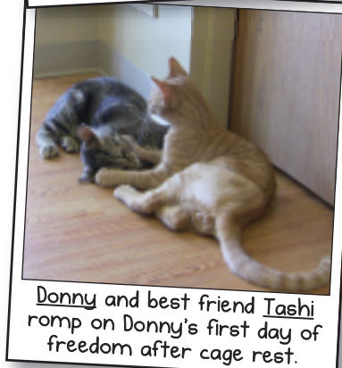
Donny and best friend Tashi romp on Donny's first day of freedom after cage rest.