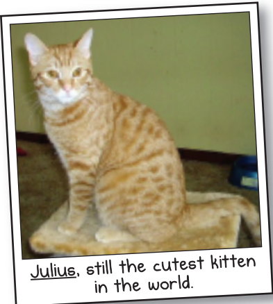
Julius , still the cutest kitten in the world.