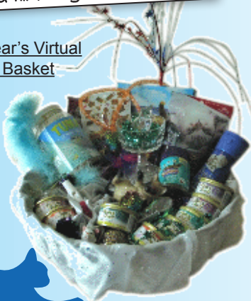
New Year's Virtual Gift Basket