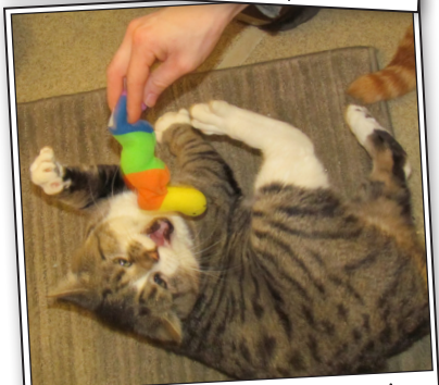
...but nothing quite compares to the fun of getting to play with you.