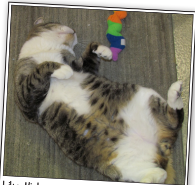
Like Kirk , your cat can amuse himself when given the proper tools...