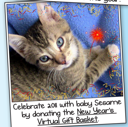
Celebrate 2011 with baby Sesame by donating the New Year's Virtual Gift Basket .