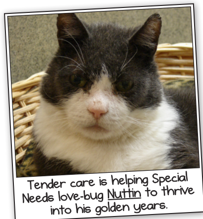
Tender care is helping Special Needs love-bug Nuttin to thrive into his golden years.

Like us, our cherished cats need a bit of "extra" TLC as they age. It's a small price to pay for affection and lifelong love.