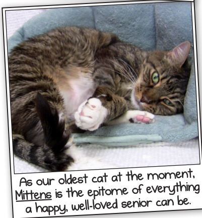
As our oldest cat at the moment, Mittens is the epitome of everything a happy, well-loved senior can be.