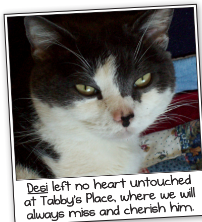
Desi left no heart untouched at Tabby's Place, where we will always miss and cherish him.

Interested in Volunteering at Tabby's Place?