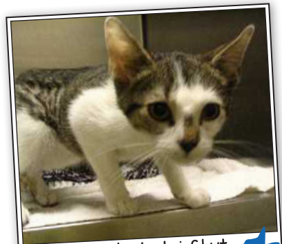
Tiny Marlee had a brief but courageous battle with FIP. We all miss her very much.

These cats usually appear thin, but with distended abdomens. The dry form of FIP can affect any tissue, most commonly the eyes, kidneys, liver, gastrointestinal tract and central nervous system. Cats with the wet form usually succumb quickly to the disease, while cats