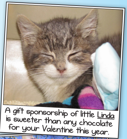
A gift sponsorship of little Linda is sweeter than any chocolate for your Valentine this year.

And, unlike a sweater or tie, your cat-centric gift is 100% tax-deductible, and can be delivered (via e-mail) within minutes of your order. To find out more and start helping homeless cats by shopping, click here .