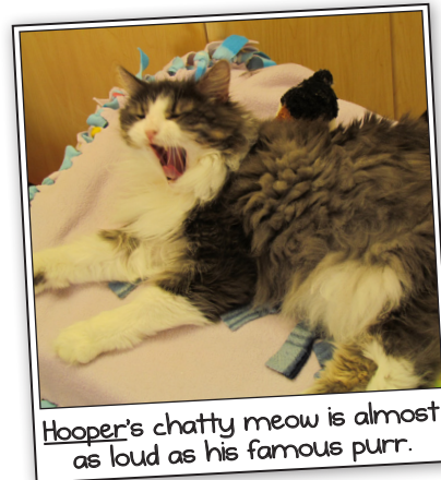
Hooper's chatty meow is almost as loud as his famous purr.

• Meows are rarely heard between cats , who apparently reserve meowing for communicating with humans. They will caterwaul when mating and chatter at prey, but find no need to meow among fellow felines. • It is speculated that cats "talk" to us because we talk to them, and that they adapt the meow based on the sounds they hear from us. Some compare this to the way humans will talk more