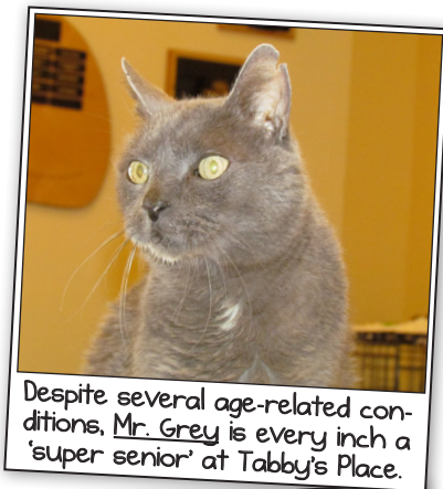
Despite several age-related conditions, Mr. Grey is every inch a 'super senior' at Tabby's Place.