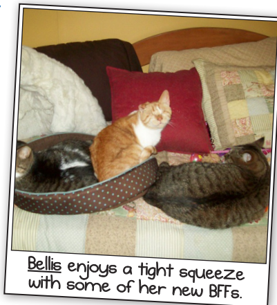
Bellis enjoys a tight squeeze with some of her new BFFs.