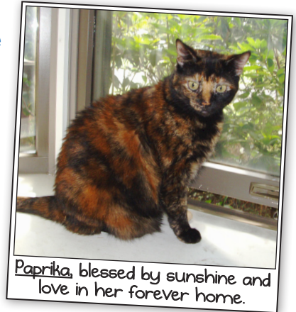
Paprika, blessed by sunshine and love in her forever home.

I never knew there was a color of cat called "tortoiseshell" until the day we met Paprika . We'd come to Tabby's Place after losing our cat Misty to kidney failure. Misty and her sister Lucy had been with us for over 10 years, and all of us - human and feline alike - were grieving. We needed a new love for our lives, not to replace Misty, but to put her own imprint on our family. Once Paprika came up to us, she captured our hearts.