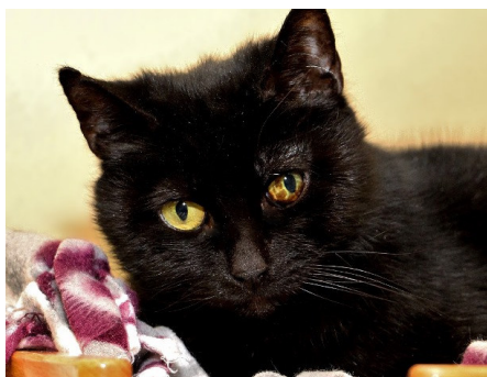
The Guardian Angel Program brought Impy to Tabby's Place

You don't like to think about it, but the odds are good that you'll outlive your cat. It's even more painful to consider the alternative. What would happen to your feline family member if you were no longer