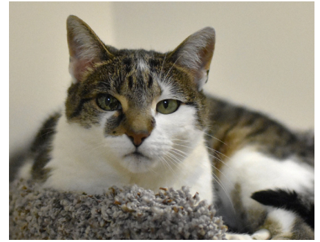
Bucca, like many senior cats, can be a bit finicky, which is cause for compromise