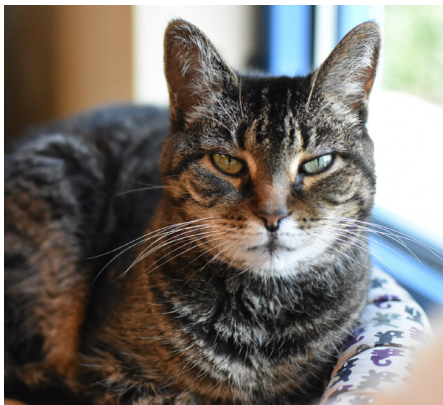
Good nutrition helps senior cats like Sugar to thrive

Age-related diseases like hyperthyroidism are associated with weight loss, and senior cats may become more finicky as their sense of smell dims. But cats