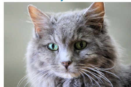
Tinkerbelle spent 1,883 days at Tabby's Place before finding her forever home