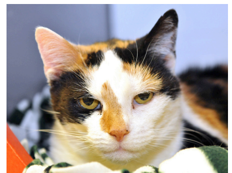
Melanie is loving life at Tabby's Place because her 'dad' planned for her to come here through the Guardian Angel Program