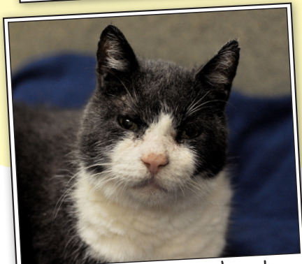
Nuttin has diabetes, heart disease, IBD, FIV and cancer - but he's living well and loving life.