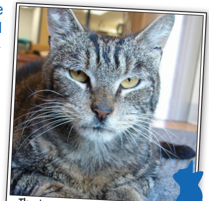
Ike is a sweet, gentle soul.