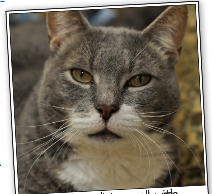
Edward is living well with CH and FIV.