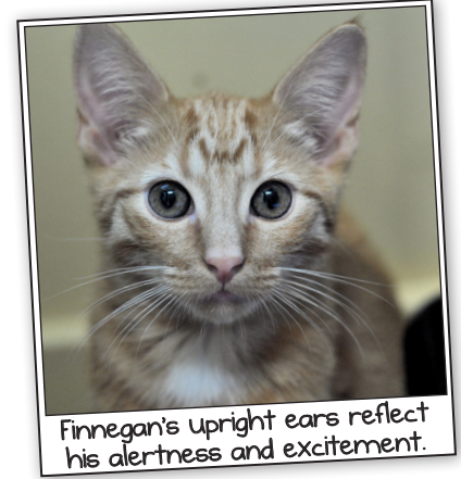
Finnegan's upright ears reflect his alertness and excitement.