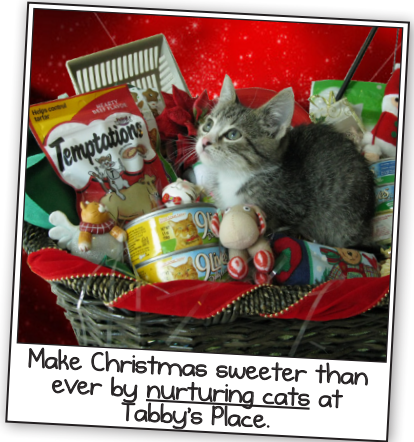
Make Christmas sweeter than ever by nurturing cats at Tabby's Place.

Editor's note: We'll be adding lots of goodies to the gift catalog between now and the holidays, so keep checking back for the latest cat-loving gifts.