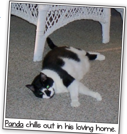
Panda chills out in his loving home.

Panda, who was living under the pseudonym " Oreo " at Tabby's Place, wanted to send his best regards to all his friends and to let them know what he's been up to since finding his forever home just before Memorial Day.