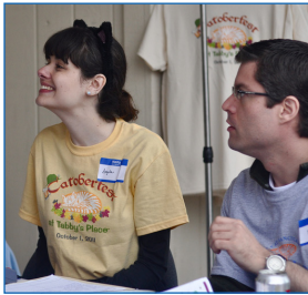
Fur Majesty, Clinton, NJ