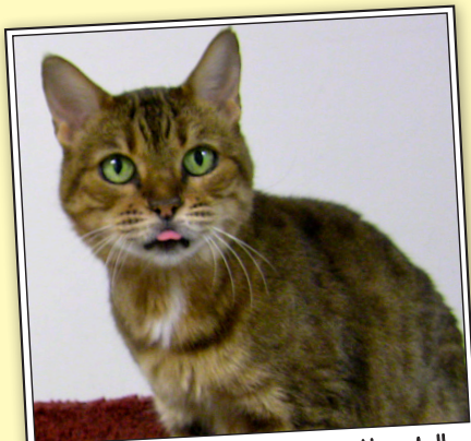
Like many senior cats, Kendall has early chronic kidney disease.