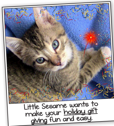
Little Sesame wants to make your holiday gift giving fun and easy.