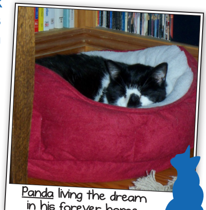
Panda living the dream in his forever home.

Panda's paperwork says that he's 13 years old, but he has so much energy that we're positive he can't be more than 3. We couldn't love him more if he were twins, and we thank everyone at Tabby's Place for taking such good care of him until he found his way into our hearts.