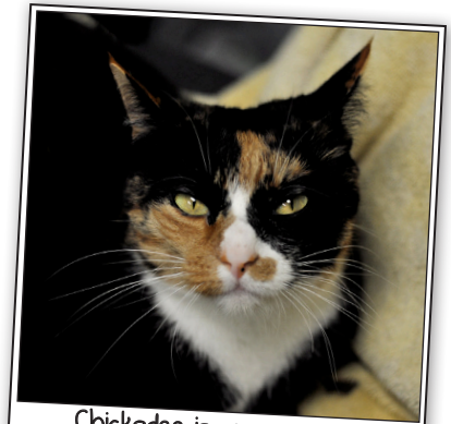
Chickadee is our newest CH sweetheart.

CH sweethearts do need a bit of extra attention, clean-up time and medical care – and they'd love your friendship. If you have room in your heart for a cat with "the cute disease," please sponsor Chickadee , Gabriella , Ike or Edward today – or "collect them all" with a four-in-one CH sponsorship by clicking here .