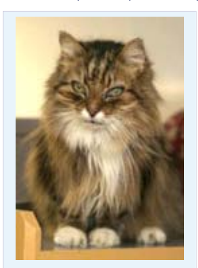
Sammy was a beloved fixture of our lobby.

On his best day, he tipped the scales at a modest seven pounds. But what Sammy lacked in size, he made up for in personality and vocalization.