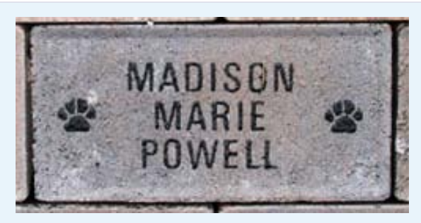
A sample brick on our walkway

You are invited to celebrate the legacy of beloved pets and people on our Memorial Walkway. For a gift of $500 or more, you can personalize one of the bricks leading from the sanctuary facility to Cherny's Garden (a tranquil space named for a lost, cherished Tabby's Place resident). Your gift pays tribute to your loved one's memory while supporting the future rescue and care of precious cats. To find out more, click here.