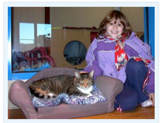
Polly and Lena

Five-year-old Polly suffers from asthma and heart disease. Typically, asthmatic cats are given steroids; in Polly's case this option is risky since steroids could exacerbate her heart condition. Like the human treatment for asthma, Polly's symptoms are treated with an inhaler. The feline inhaler covers a cat's nose and mouth and is very effective.