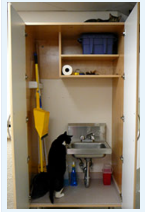
Mr. French inspects the new closet