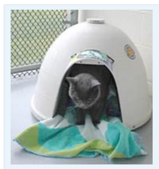
Tabby's Place keeps a Dogloo<sup>(TM)</sup> for Tippy, who enjoys the outdoor solarium even in winter.

If you have an outdoor outlet, you can purchase a Dogloo™ with a plug-in heating pad. Dogloos are igloo-shaped dog houses found online or at PETCO. Dogloo™ also makes heated water bowls to keep the cat's drinking water from freezing.